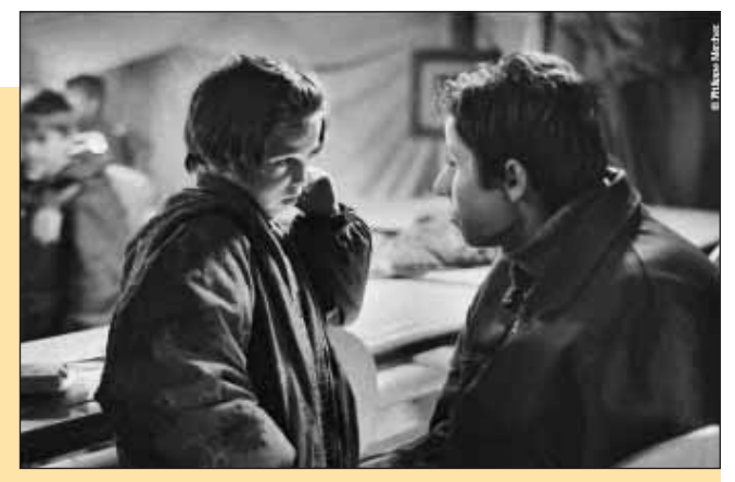
Kosovo - Temporary school in a tent: "Let me tell you a secret"