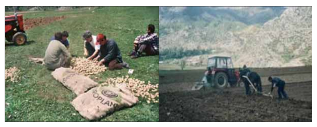
19 - Cf. Info Génération Humanitaire magazine, issue n°2, March 2002

The programme was completed by technical training and support adapted to suit the potato growers' association in the region.