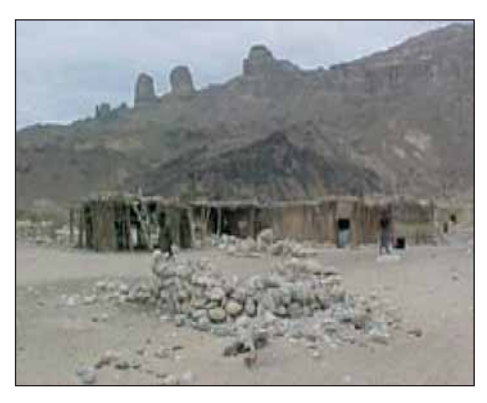
Dwelling in Wadi Masila

In March 2004, Triangle set up a programme to improve the primitive sanitary living conditions of the isolated population in Wadi Masila in Yemen. This project consisted of supplying drinking water (digging wells and building latrines) for the populations of forty or so nomad and sedentary communities located in Wadi Masila (governorships of Al Mahra and Hadramaout). The objective was to ensure access to drinking water on a long-term, secure basis for the populations benefiting from the scheme,