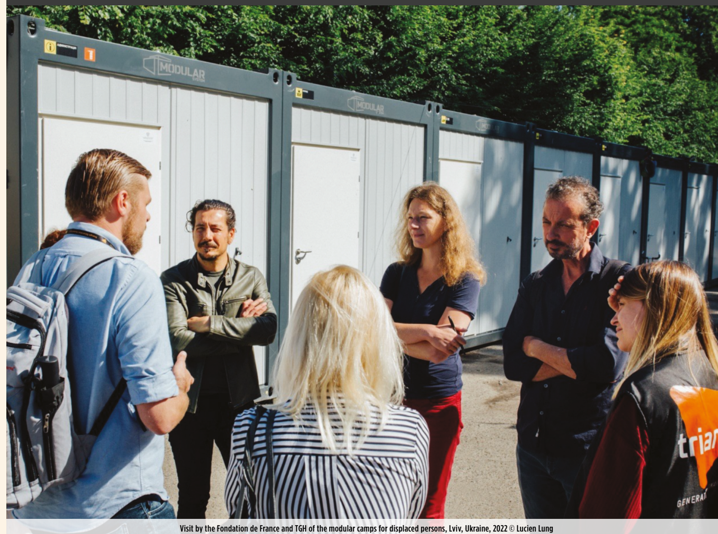
Visit by the Fondation de France and TGH of the modular camps for displaced persons, Lviv, Ukraine, 2022

Having worked in Ukraine since 2015, TGH has developed a capacity to implement high-quality humanitarian programmes with a high level of acceptance from the local authorities and communities. This has allowed TGH to establish solid partnerships with numerous national organisations in the country. When the war broke out in Ukraine, these partnerships and this experience facilitated TGH's operational deployment, as well as the identification of, and access to, isolated beneficiaries in the most difficult-to-reach oblasts. ■