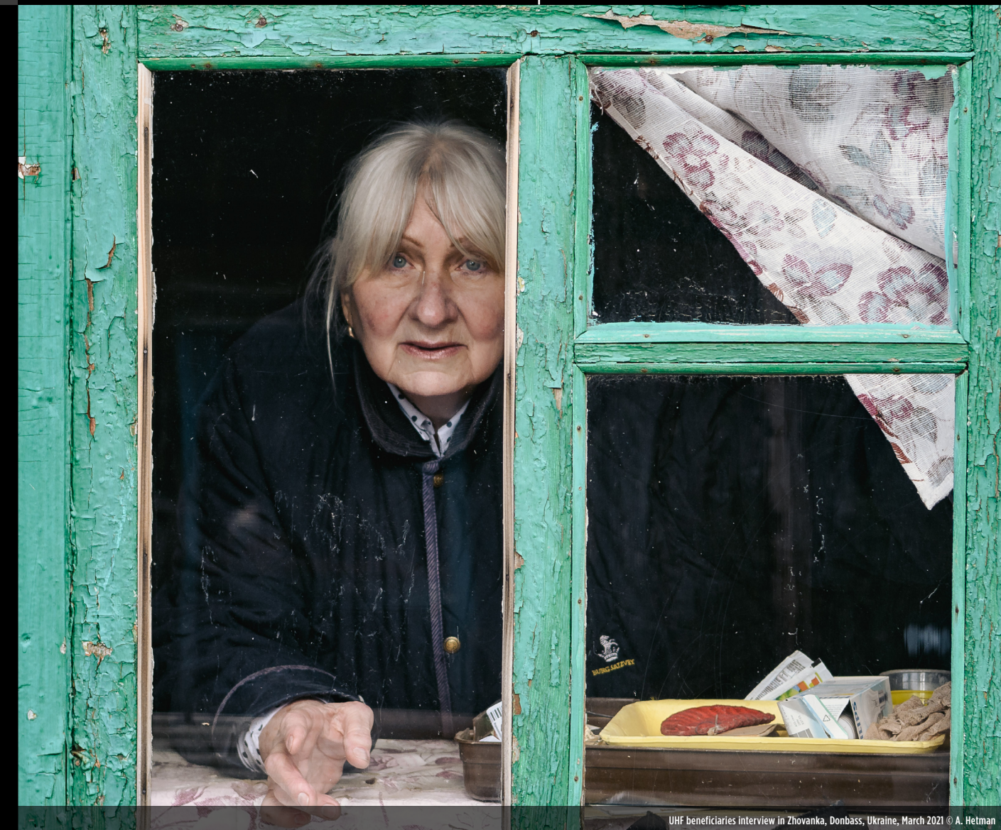
UHF beneficiaries interview in Zhovanka, Donbass, Ukraine, March 2021